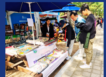
Hi-Wellness Festa in Korea