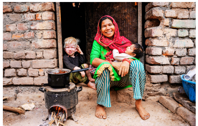
Improved Cook Stoves, Rural Communities & Climate Change

India's rural heartlands are witnessing a remarkable transformation, embracing a healthier and more sustainable future.