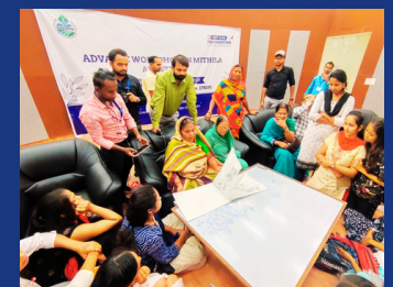
East Himalayan Trade Fair, Guwahati